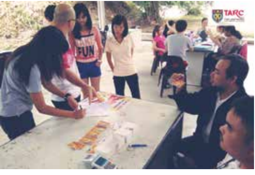
▲ Full ETC Promotion at Tunku Abdul Rahman College (TARC) on 7th & 8th July 2015

DUKE 1 was completed and open to traffic in 2009.