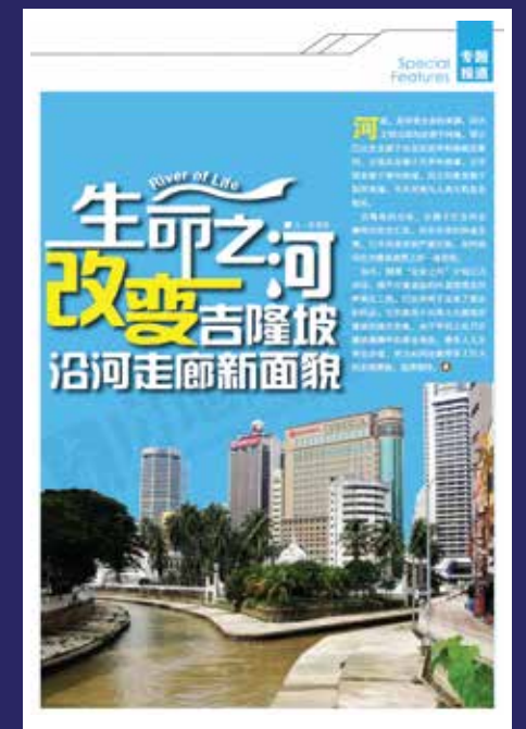
▲ River of Life, August 2014