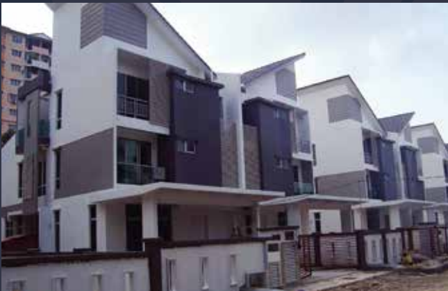
K8 Actual Site

▼ Oasis Kajang Construction Progress As of September 2015