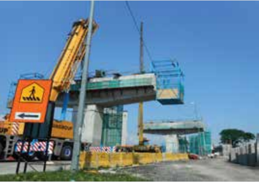
▼ Preparation of Working Platform for Crosshead Stressing Works at Tun Razak Link

DUKE 2 is targeted for completion by end of 2016.