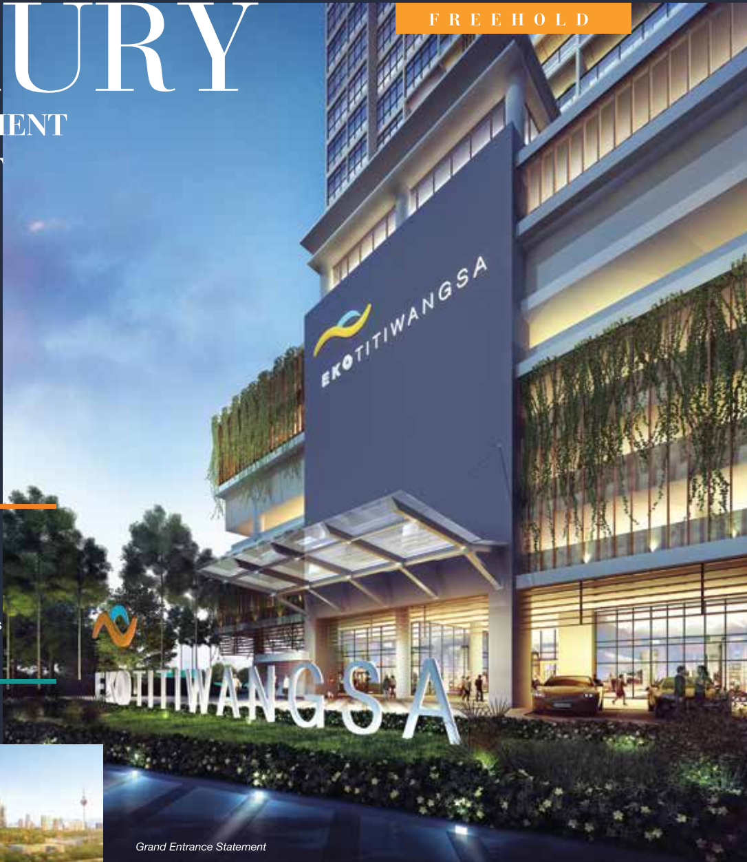
Grand Entrance Statement

EKOTITIWANGSA is another magnificent project by EKOVEST that aims to satisfy business and lifestyle needs. Inspired by the concept of exclusive living and built for quality. It has a restrained yet elegant exterior look.