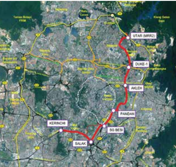
▲ The proposed alignment of DUKE Phase 3

The main objective of DUKE Phase 3 is to provide an alternative route for road users with an improved and a more efficient traffic dispersal system in and around Kuala Lumpur city centre to complement and relieve peak-hour congestion on existing arterial roads and expressways.