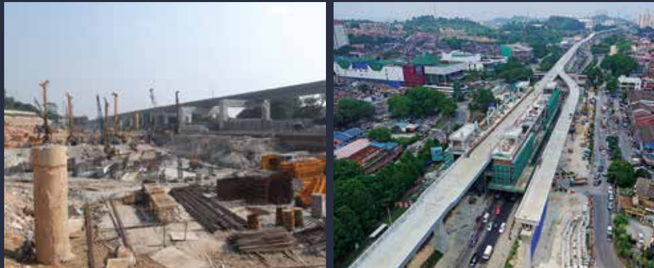
▼ EkoCheras Construction Progress

We have also considered your peace of mind with our 3-tier security and surveillance system. We hope that you will not only live in, but also enjoy EkoCheras.