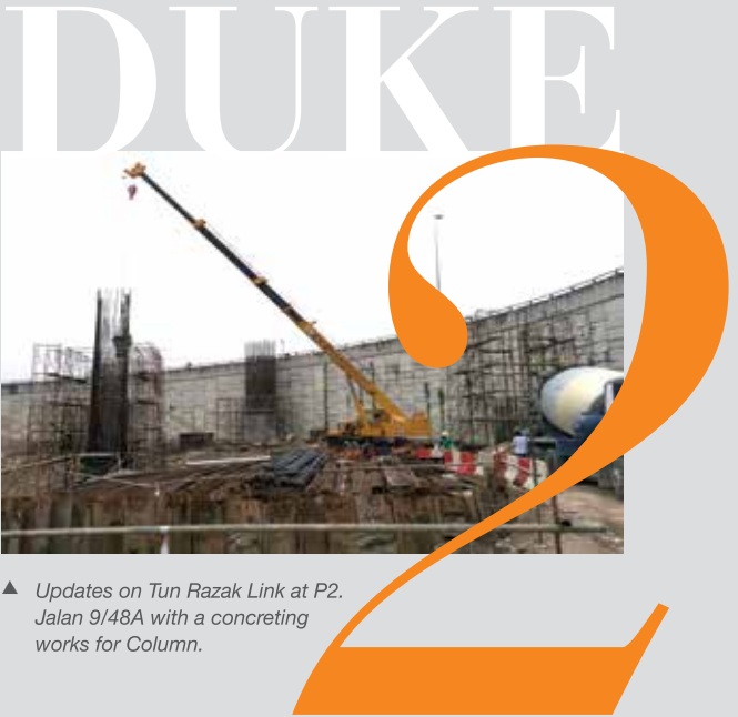
▲ Updates on Tun Razak Link at P2. Jalan 9/48A with a concreting works for Column.

Actual physical progress (construction) until 25 th July 2015 is 51.40%, which is ahead by 1.40% ahead of schedule. Currently, main activities for Tun Razak Link and Sri Damansara Link are bored piling work, construction of pier column, cross-head and beam and launching of cross-head.