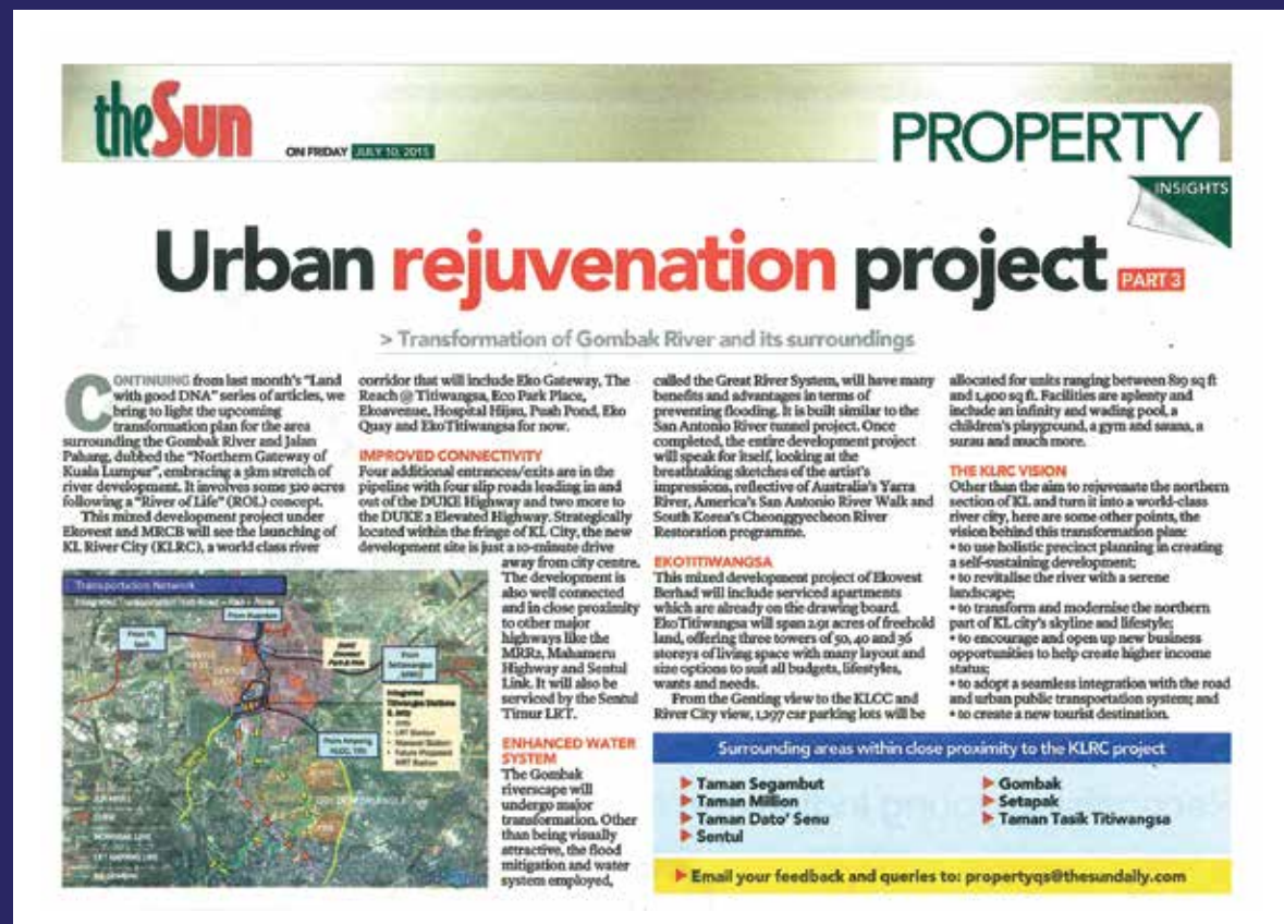
▲ The Sun Newspaper, 10 th July 2015, Friday