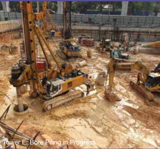
Tower E: Bore Piling in Progress