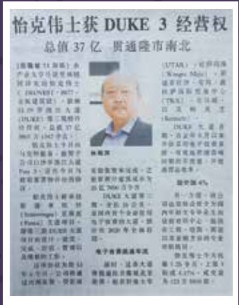
News Release resources by Nan Yang Siang Pao, 12 Jan 2016, Tuesday