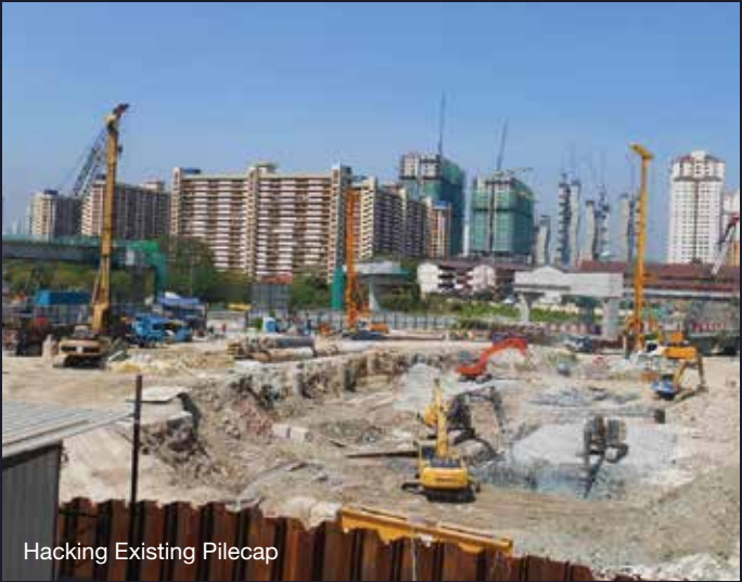
Hacking Existing Pilecap