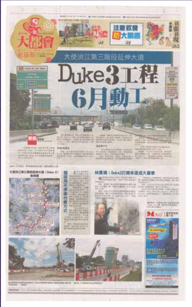
News Release resources by Sin Chew, 28 Jan 2016, Thursday