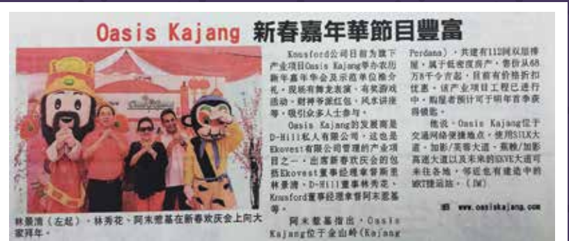
News Release resources by Sin Chew, 24 Feb 2016, Wednesday