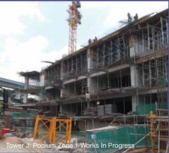
Tower J: Podium Zone 1 Works In Progress