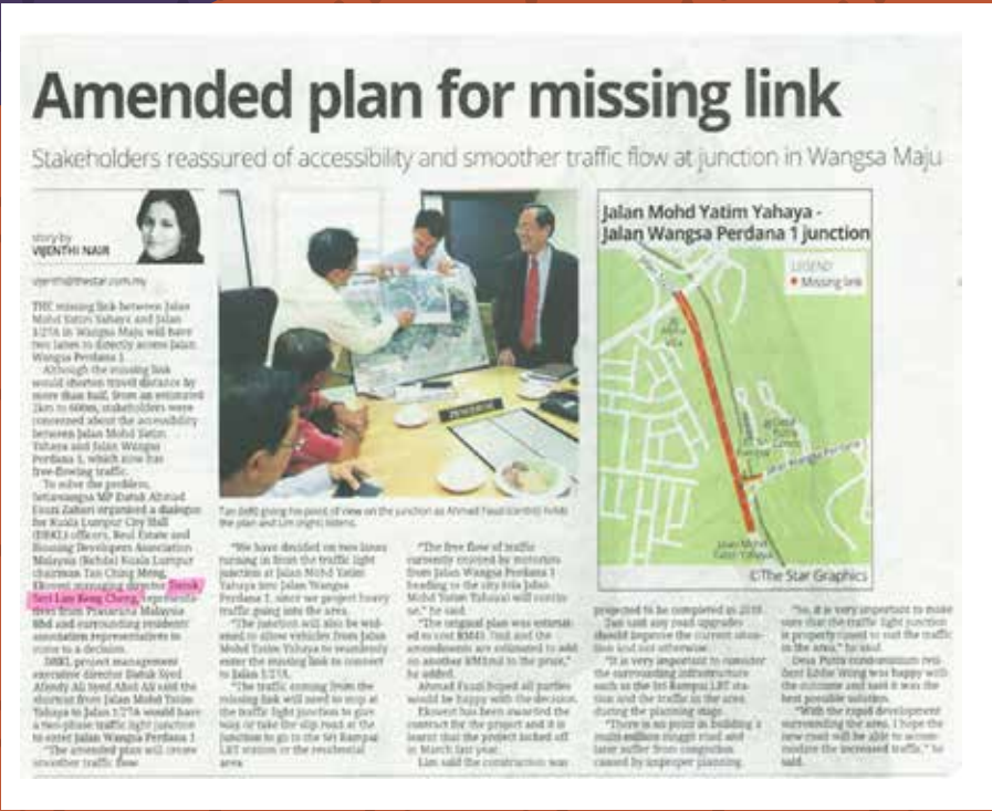
News Release resources by The Star, 4 March 2016, Friday