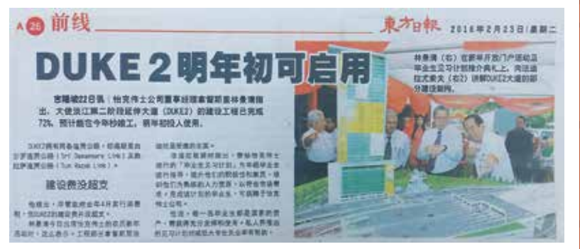
News Release resources by Oriental Daily, 23 Feb 2016, Tuesday