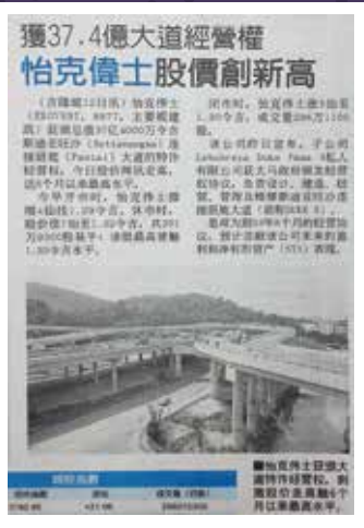
News Release resources by China Press, 13 Jan 2016, Wednesday