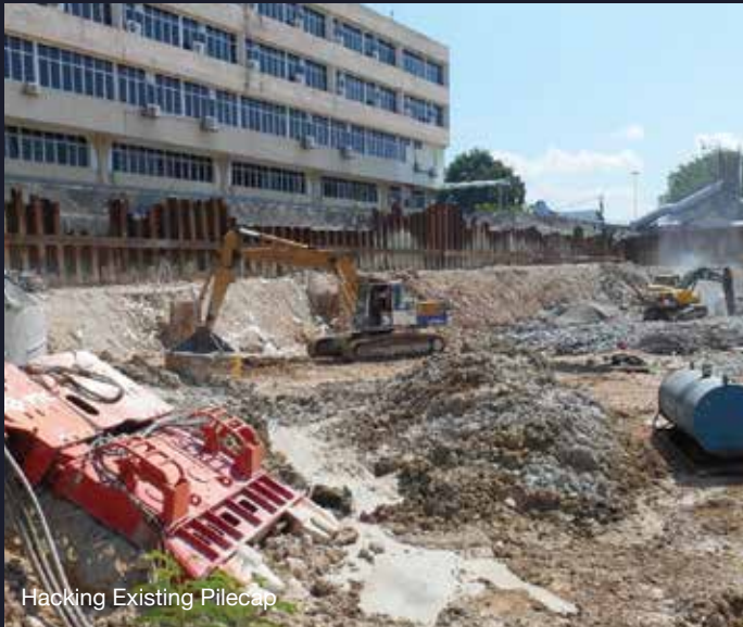
Hacking Existing Pilecap