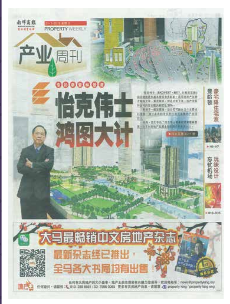
News Release resources by Nan Yang Siang Pao, 31 Jan 2016, Sunday