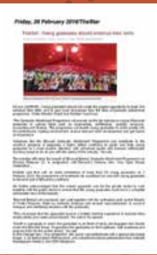
News Release resources by The Star, 26 Feb 2016, Friday