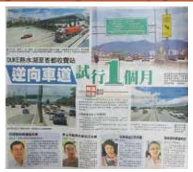
News Release resources by Sin Chew, 21 Feb 2016, Sunday